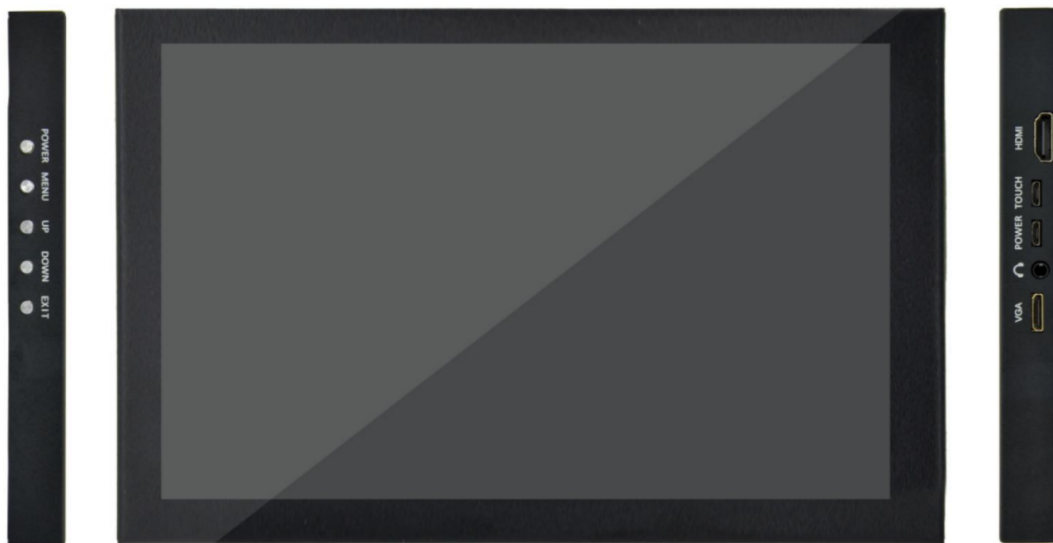
DEBIX TD101H-C (with Al alloy enclosure)